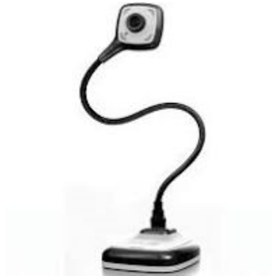
Fig. 3. HUE Camera from Amazon.

As jury trials continue remotely due to COVID-19 restrictions, the point is this: though there are obstacles to remote witness testimony, there are remedies to effectuate remote proceedings.