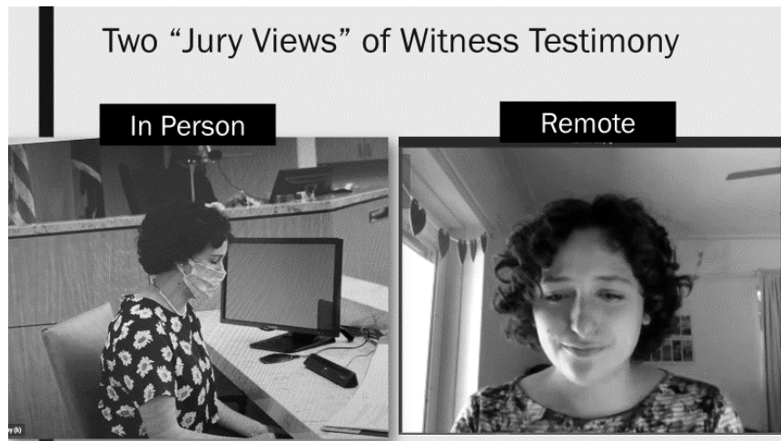
Fig. 1. Jury Views of Witness Testimony (2020).

One of the witnesses needed to convey tearful emotion while testifying. She appeared in the two modes to two separate mock juries: